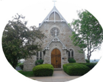
Memorial Chapel 626 Scott Avenue