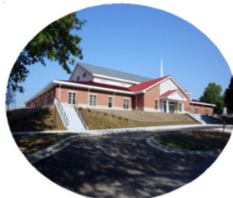
Frontier Chapel 625 Thomas Avenue