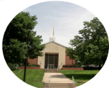
Pioneer Chapel 500 Pope Avenue

Mission: To provide Religious Support to all Soldiers, Family members, DA civilians, contractors, and retirees.