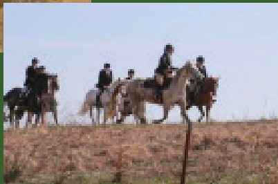
FLH members riding at the Easton hunt fixture (top) and the fixture in the Kansas Flint Hills (bottom).