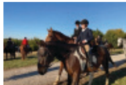
Junior riding out

The Field Master is the most important person for riders in the field. They lead the field, and no riders in the field should ever pass them during a hunt. Their job is to keep the field close enough to enjoy watching the hounds pursue the fox or coyote without being so close as to interfere with the huntsman.