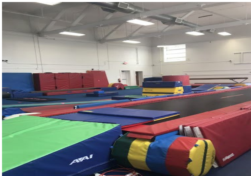
Photo of our well-equipped gym at the Patch Community Center

If your child's play is tumbling in your living room, we can provide a safe and well-equipped gym with proper instruction on post!